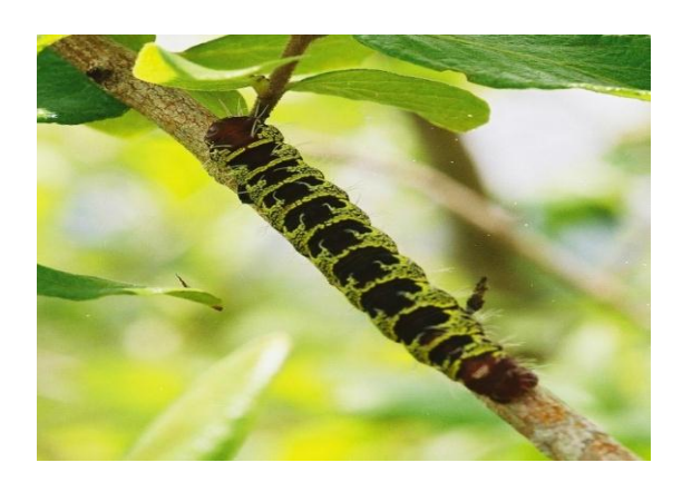
Figure 1d. Caterpillar from Kongo Central (in DRC)