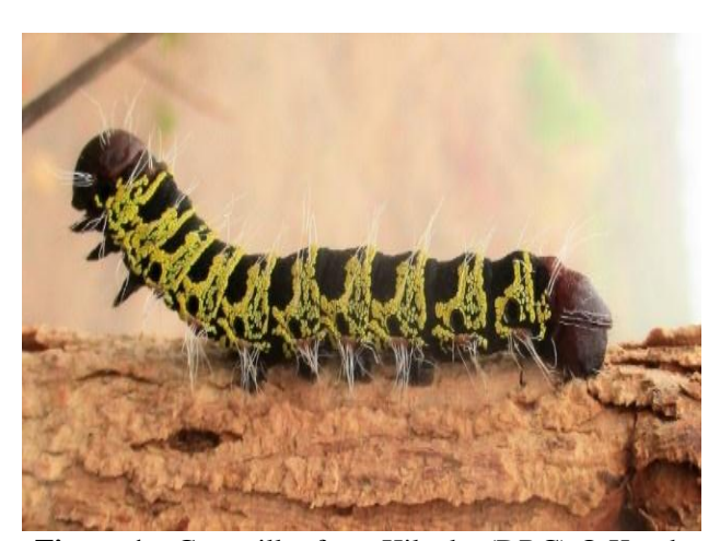
Figure 1a. Caterpillar from Kilueka (DRC)

The genus Cirina is often associated (sometimes confused) with the genus Imbrasia. The problem therefore exists among the highly gregarious caterpillars which together provide the most important species of food and economic interest. Okangola et al. (2016) in a study on the nutritional values of edible caterpillars from the city of Kisangani and its surroundings (Tshopo Province, Democratic Republic of Congo) published a photo of Cirina forda under the name of Bunaeopsis aurantiaca in the International Journal of Innovation and Scientific Research 25(1): 278-286. From a morphological point of view these two species are totally different and cannot be confused, simply because Bunaeopsis aurantiaca caterpillars have spines while Cirina forda do not.