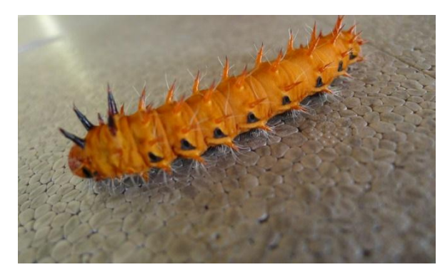
Figure 4b. Munsongo from Trichilia gilgiana