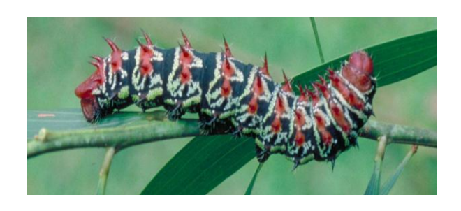
Figure 9. Caterpillar of Gonimbrasia jamesoni

number of genera, the main ones being Imbrasia , Cirina , Gonimbrasia and Nudaurelia but also Bunaeoides , Pinheyella and apparently a few undescribed (despite Cooper's many new names). This also seems to agree with the morphological differences, although again no one has done a proper and comprehensive study so far. But we either have to deal with all these genres separately or group them all into Imbrasia (sensu lato). Other authors to be certain of the name of the caterpillar were based on