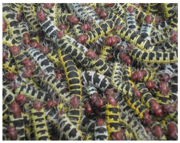
Figure 1b. Caterpillars from Voka (Boko, in Congo Republic)