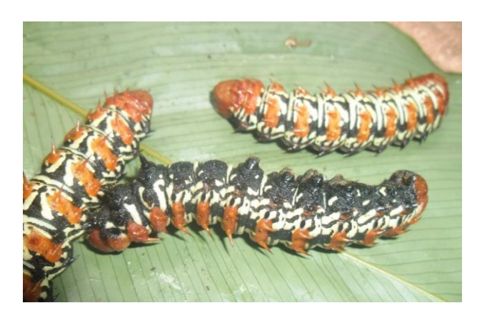
Figure 6. Caterpillars of Imbrasia obscura Butler (species n° 11) photo taken on August 20, 2016, in Pokola (North of the Republic of the Congo), © Germain Mabossy-Mobouna.

et al. (2017), Mabossy-Mobouna et al. (2018). These reports are from five countries: Cameroon, the Central African Republic, the Republic of the Congo, the Democratic Republic of Congo and Angola. One of the aforementioned articles publishes a good photo of the caterpillar, but without determination (Meutchieye et al., 2016), another article publishes a good photo of the caterpillar, but names it Gonimbrasia hecate (Okangola et al., 2016). "(sic).