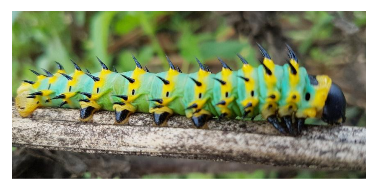
Figure 2. Bunaeopsis aurantiaca (Rothschild, 1895)