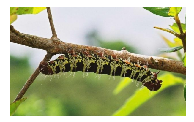
Figure 1c. Caterpillar from Kongo Central (in DRC)