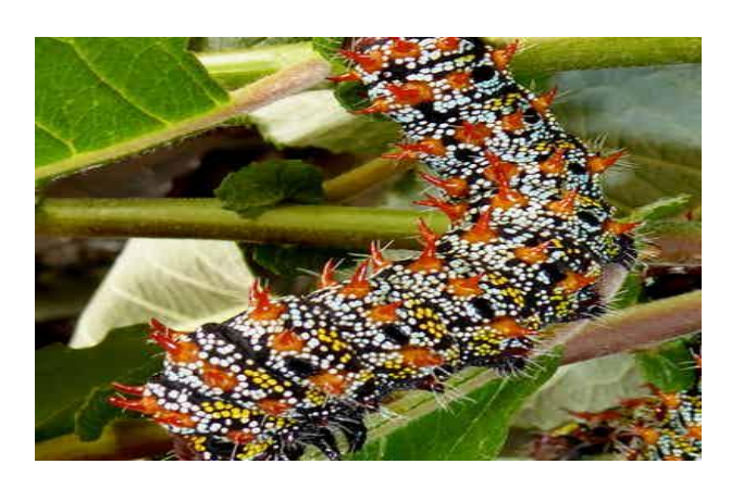
Figure 7 . Gonimbrasia hecate , © Jurgen Vanhoudt. http://www.silkmothsandmore.com

Other confusion exist. Thus, Malaisse and Parent (1980) report the consumption of Tagoropis flavinata (Walker, 1865) from Katanga. However, this species only exists in southern Africa (Oberprieler pers. comm.). Furthermore, there is now molecular evidence (although unpublished and in need of verification) that the Imbrasia complex splits into a