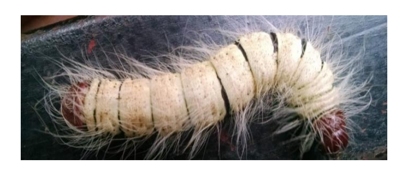
Figure 5. "Mimpemba" a caterpillar whose scientific name is not yet known. Photo taken at Loumou, south of Republic of the Congo (04°08'S, 15°07'E, altitude 365 m), on 29<sup>th</sup> July 2019.

The caterpillar in photo (h) figure 1 in Okangola et al. (2016) named Bunaeopsis aurantiaca probably corresponds to the caterpillar in figure 11 of Bocquet et al. (2020) published in the journal Geo-Eco-Trop, vol. 44 (1) and those of Mabossy-Mobouna et al. (2022)(see page 21) named Pseudantheraea discrepans . On the other hand, the caterpillar named Pseudantheraea discrepans in figure 1, photo (h) page 281 of Okangola et al. (2016), a white caterpillar, is quite different from the Pseudantheraea discrepans in figure 11 of Bocquet et al. (2020) page 118 and on page 20 in Mabossy-Mobouna et al. (2022) published in African Journal of Tropical Entomology Research, Vol. 1 (1):3-27.