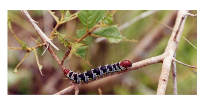
Figure 1e. Caterpillar from Kongo Central (in DRC)