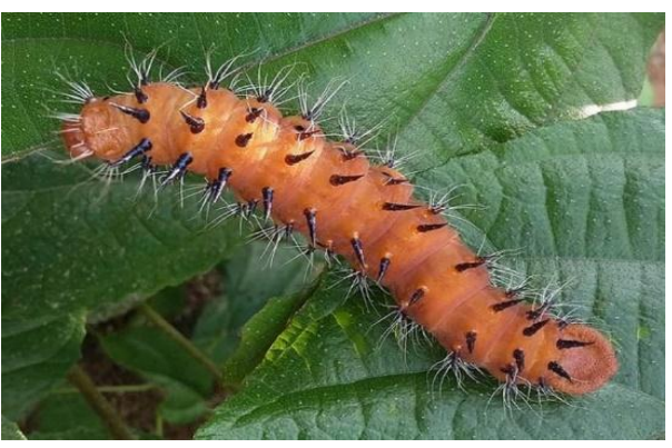
Figure 3. Two photos of Pseudantheraea discrepans (Butler 1878?) © Lucien Mballa.

Two caterpillars (figure 4) which are almost identical to the two photos of Pseudantheraea discrepans (figure 3) belong to another species and feed on different plants. One of the caterpillars has Mangifera indica as host plant and the other has Trichilia gilgiana . The people of Kilueka (Kongo Central, in DRC) call them Munsongo and differentiate them by their host plant: Munsongo from Mangifera indica (figure 4a) and Munsongo from Trichilia gilgiana (figure 4b).