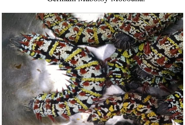
Figure 8. Caterpillar of Gonimbrasia melanops