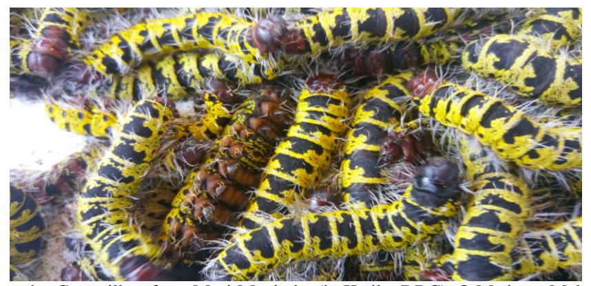
Figure 1g. Caterpillars from Masi-Manimba (in Kwilu, DRC) © Madamo Malasi

The photo of Bunaeopsis aurantiaca below (figure 2) was taken by Louise Nkulu Ngoie near Lubumbashi in D.R. Congo and another photo of this caterpillar (not included in this article) was taken by Paul Latham. The caterpillar was identified by Thierry Bouyer. The name of this caterpillar is attributed erroneously to other species in the literature. For example Okangola et al. (2016) "Edible caterpillars of Kisangani and its surroundings", presents on page 280, Figure 1, six photos in which one (f) is named Bunaeopsis aurantiaca . Page 281 of the same article